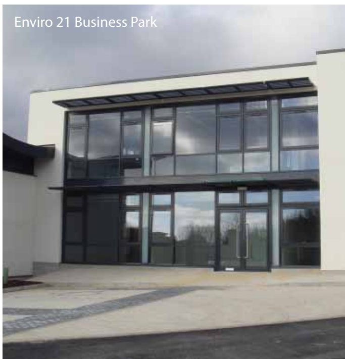
Enviro 21 Business Park

Environmental technology consulting has a strong presence in the South East economy. A wide range of expertise and experience is based here, including environmental impact analysis, ecological survey, and technology and life-cycle assessment. The region is also home to a significant number of oil and gas consultancies, along with a number of major consulting firms (Mott MacDonald, Arup, Atkins, RPS) – they are actively developing the large infrastructure projects that are key to a sustainable future.