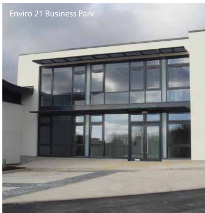
Enviro 21 Business Park

Environmental technology consulting has a strong presence in the South East economy. A wide range of expertise and experience is based here, including environmental impact analysis, ecological survey, and technology and life-cycle assessment. The region is also home to a significant number of oil and gas consultancies, along with a number of major consulting firms (Mott MacDonald, Arup, Atkins, RPS) – they are actively developing the large infrastructure projects that are key to a sustainable future.